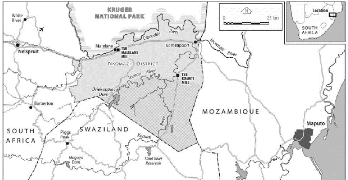
Figure Error! No text of specified style in document..1 Shaded project area